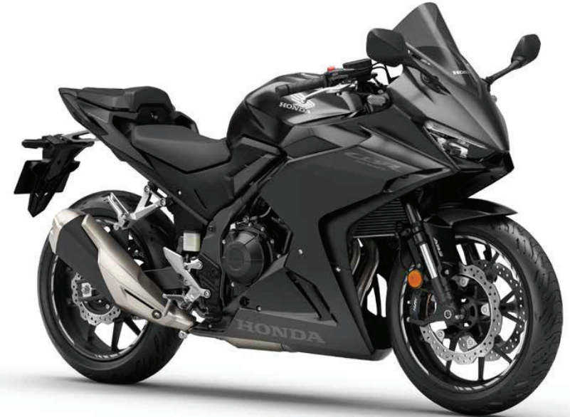
The CBR500R Cup.