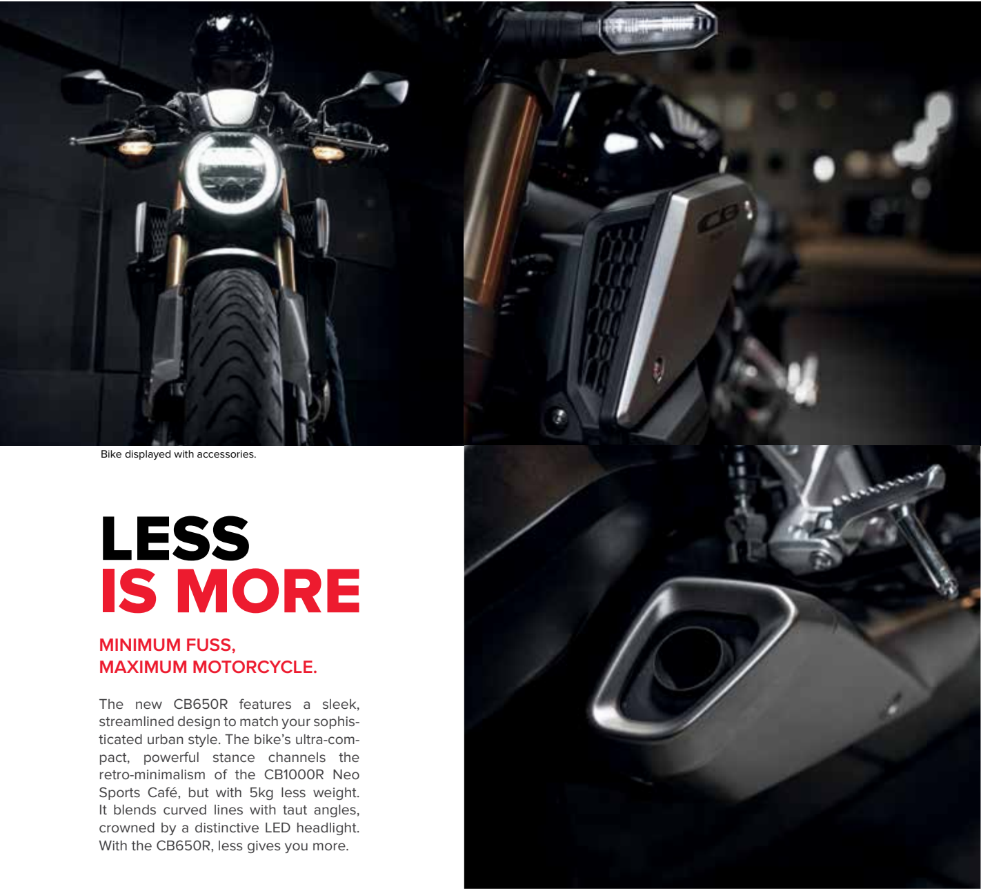
Bike displayed with accessories.