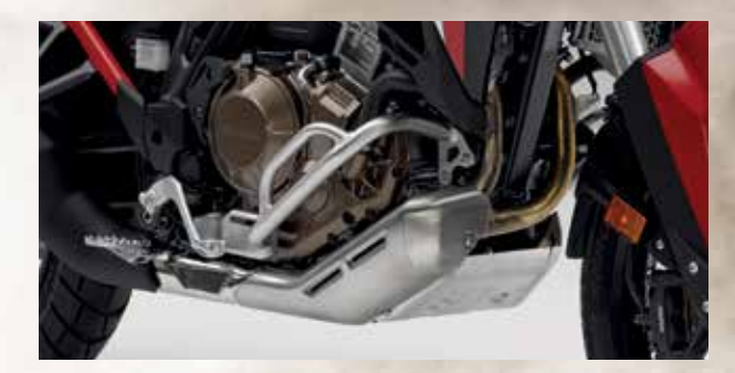
ENGINE GUARD Constructed from stainless-stell, specially designed to protect the engine in arduous riding conditions

Designed to offer extra boot grip and leverage - and not to get packed out with mud - the rally foot rests are also built tough for arduous conditions.